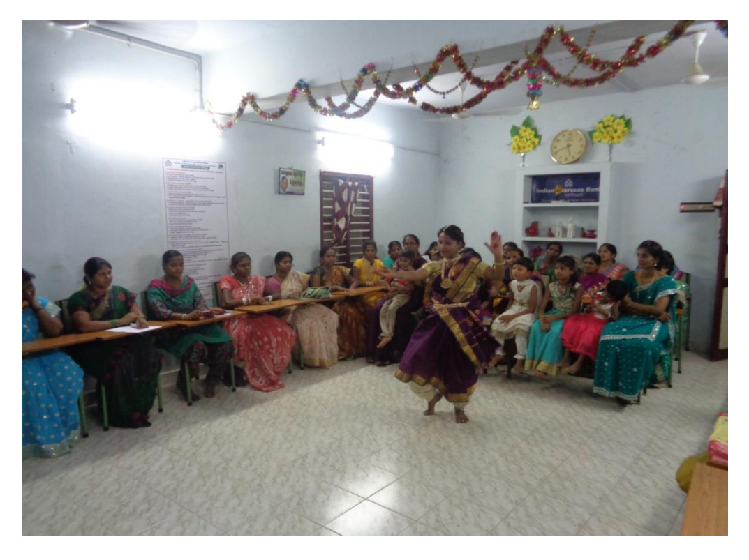
A success story of one of the candidates follows: