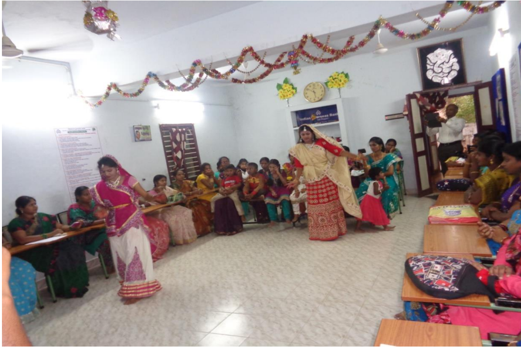
Cultural program by trainees during valediction function (Bharatnatyam by trainees)